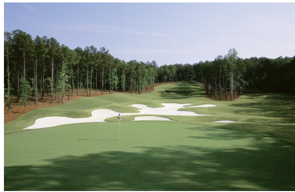
The 14 th hole on Great Waters (left) and No. 13 at Oconee represent the beauty and challenges of Reynolds Lake Oconee.