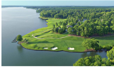
No. 4, No. 5 at The Landing.

Since MetLife’s acquisition of the lakeshore destination in August 2012, five of the six golf courses have undergone substantial investment and improvements, part of the $40 million in ongoing renovations.